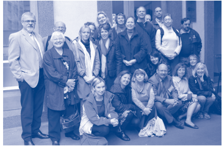
Participants in the Partnership Conference

The first of these, which occurred from September 10-16, was a visit by 28 Presbyterian women from different parts of the United States. This event, which is called the Global Exchange and is put on