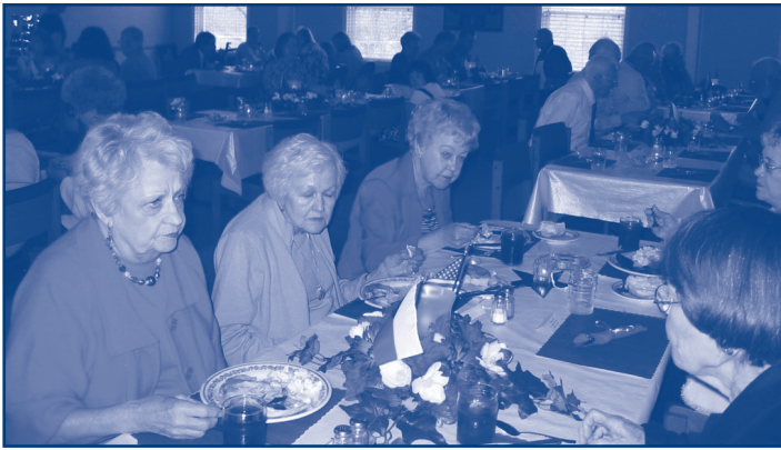
Folks at Trinity Presbyterian Church enjoying a Czech meal

ning a potluck dinner or picnic, events with the youth, and activities in the community. This surely will be a summer to remember.