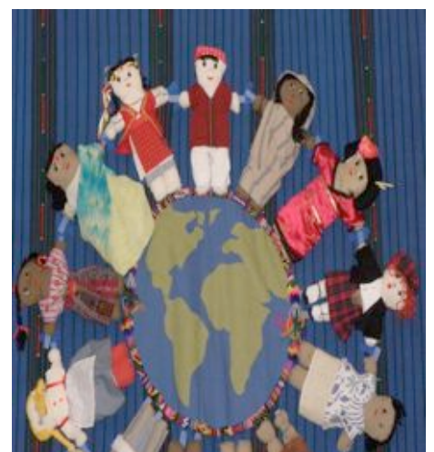
We are all one global family

A good way to start my visit in the Presbyterian Church (USA) was a visit to the congregation in Annapolis. This congregation has already been a partner congregation of an ECCB congregation in Letohrad, East Bohemia for 10 years. There is a vivid partnership and a very good formal agreement between Annapolis and Letohrad about the partnership. Almost a hundred people have visited Letohrad and the Czech Republic during this partnership. One shared project is a tutoring program for people who want to practice their English with native speakers, the participants are invited to the church to participate in evening classes and at the same time learn something about the congregations as well as about Christian