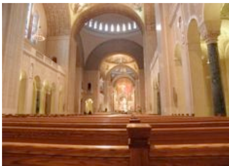
Roman Catholic Cathedral