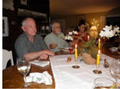
Sharing at the Manse

In the evening of the first day in Annapolis there was a gathering at the manse with delicious food from the grill in the garden and very good salads and other fine things. We had a very nice talk about the partnership between Annapolis and Letohrad, about the situation of the ECCB, the question of reconciliation between Czechs and Germans and also about our plans for the Kirchentag 2011 in Dresden (June 1-5, 2011). We had the idea that it could be very interesting and enriching, if somebody from Annapolis would join a group from Letohrad going to the Kirchentag,