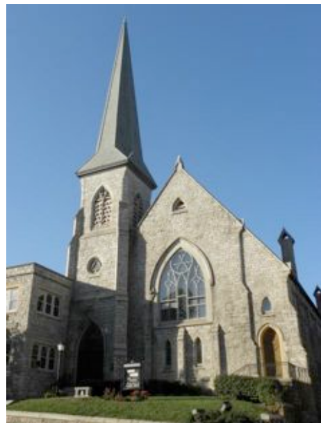
Presbyterian Church in Cumberland